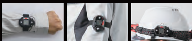
Attached to wrist (wristwatch type) *Attached to watch band