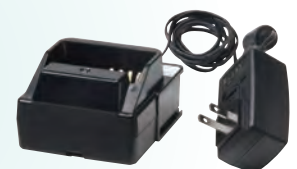
Charger BC-2012 AC adaptor for charger BC-2012